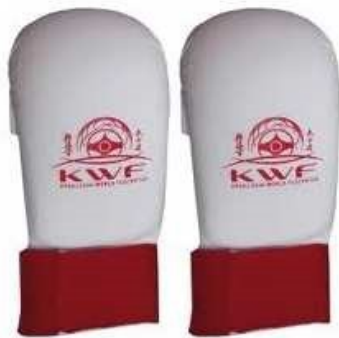
GLOVES (FROM 12 TO 13 YEARS)