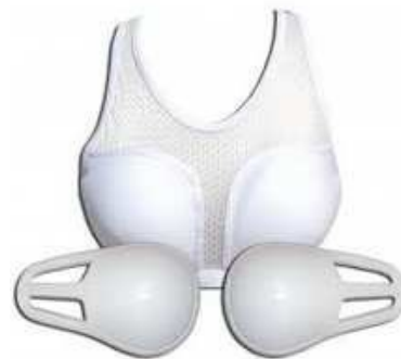
CHEST PROTECTOR FOR GIRLS