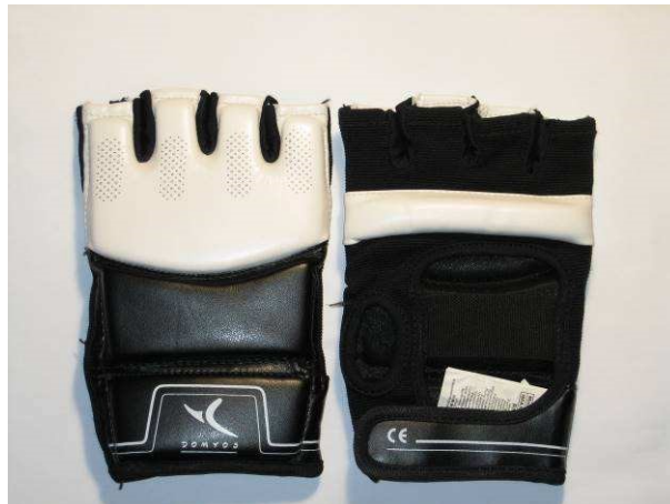
GLOVES (FROM 14 TO 17 YEARS OLD)

Another type of protections will be allowed if they offer the same level of protection.